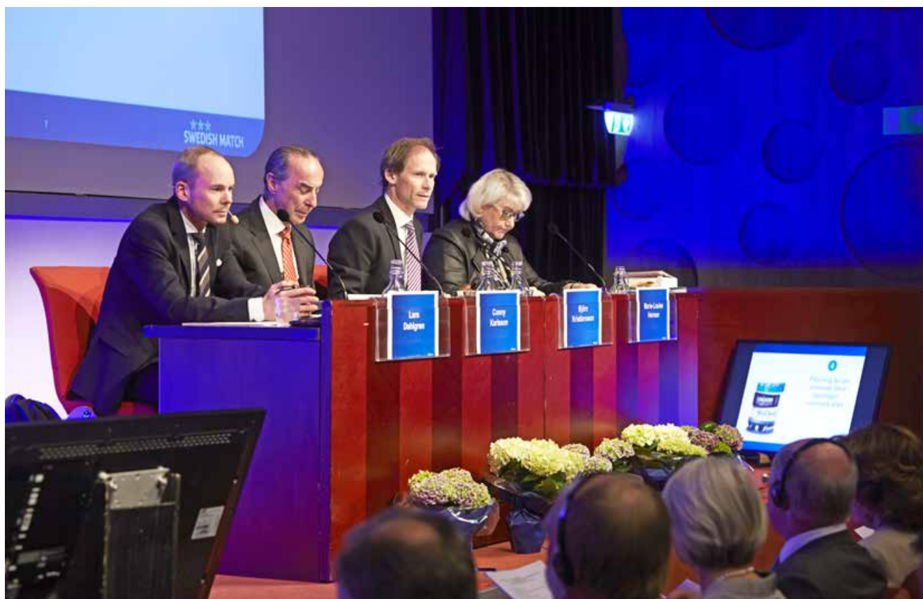
Swedish Match Annual General Meeting 2015.

Members of the Disclosure Committee during 2015 were the heads of Business Control, Investor Relations and Corporate Sustainability, Corporate Control, as well as Legal Affairs.