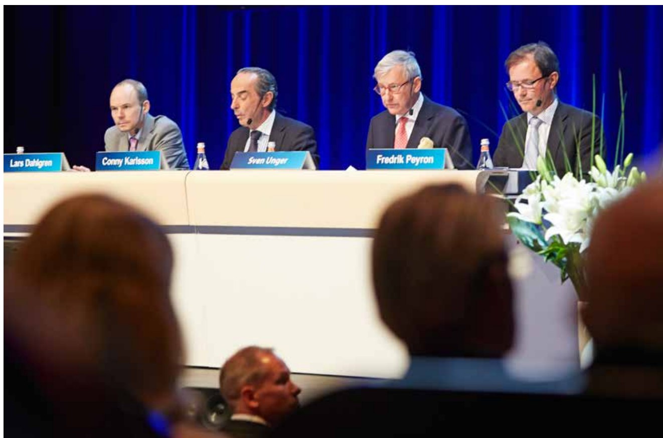
Swedish Match Annual General Meeting 2014.

Members of the Disclosure Committee during 2014 were the heads of Business Control, Investor Relations and Corporate Sustainability, Group Reporting and Tax, as well as Corporate and Legal Affairs.